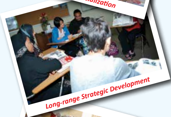
Long-range Strategic Development