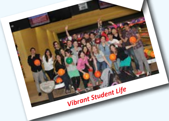
Vibrant Student Life