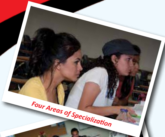
Four Areas of Specialization

TOEFL-PBT: 550 TOEFL-CBT: 213 TOEFL-IBT: 79 IELTS: 7.0